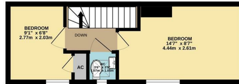
1ST FLOOR 244 sq.ft. (22.6 sq.m.) approx.